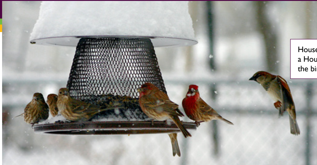
House Finches and a House Sparrow at the bird feeder.